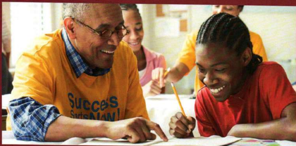
(Pictured: A Foster Grandparent volunteering in a Head Start classroom)